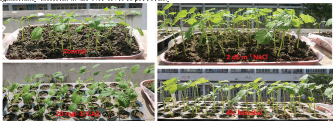
Figure 1. Biter gourd seedling growth after different priming treatment

FGP = Final germination percentage; SL= shoot length; FW= Seedling fresh weight; DW=Seedling dry weight; RN=Root number; VI=Vigour index. Means with the same letters in each column are not significantly different at the 0.05 level of probability